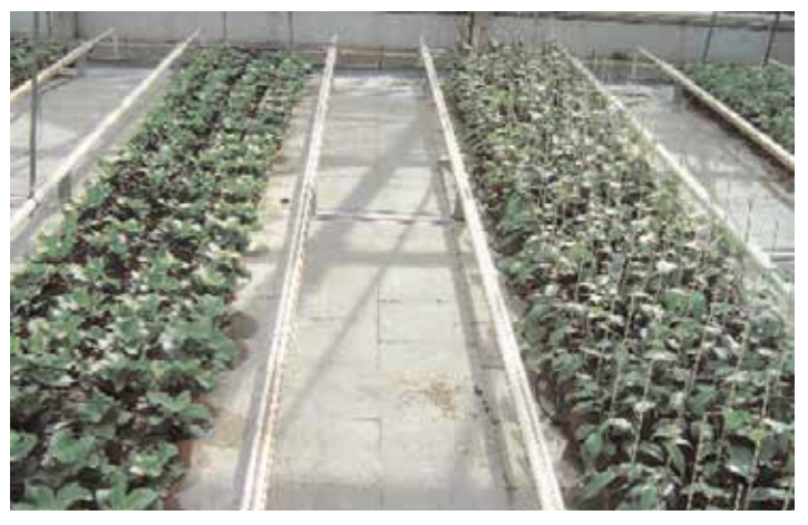
Shadows with clear covering